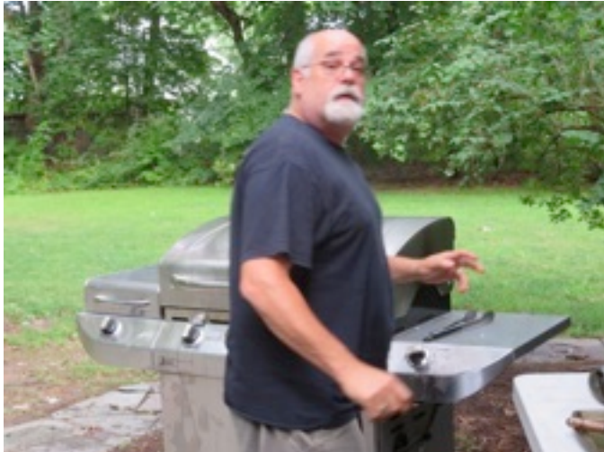
Surprising the chef at work