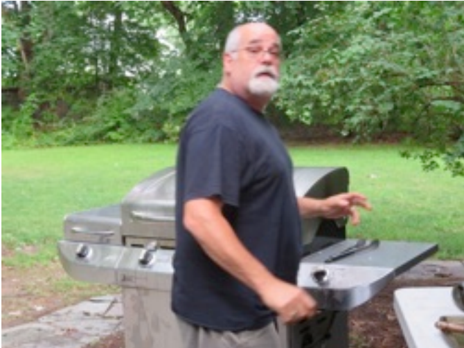
Surprising the chef at work