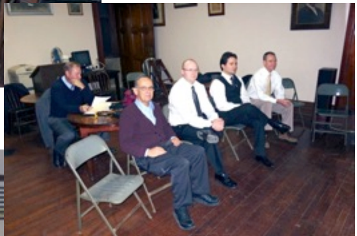
The Boss and those who wait